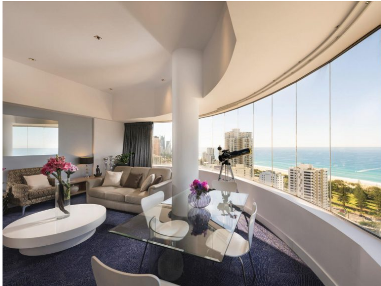
Penthouse at Sofitel Gold Coast Broadbeach